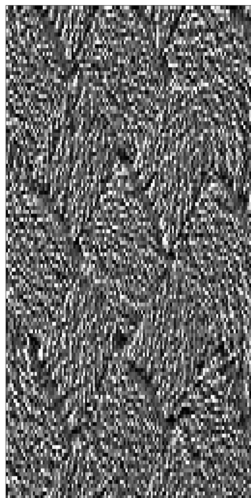
TI * PEF